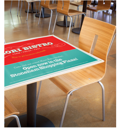
Water and chemical resistance