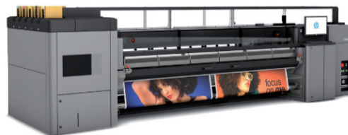
HP Latex Technology is a single-step process