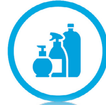
Water and chemical resistance