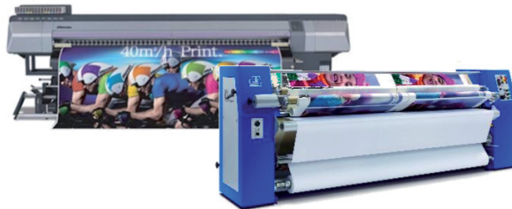
Dye sublimation is a two-step process requiring a specialized textile calender

Find a comprehensive list of all latex compatible media along with finished color profiles and printing settings at hp.com/go/mediasolutionslocator