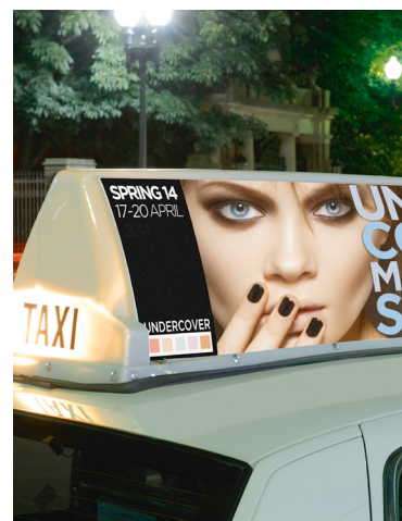
Economical liquid lamination on fleet graphics