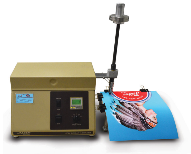
Figure 1 Scratch and abrasion testing are performed using a Taber tester, according to industry-standard test methods. 5

HP tests scratch and abrasion resistance using a Taber tester (Figure 1) and according to industry-standard test methods. 5