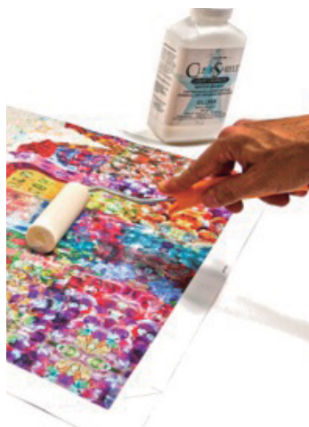
Liquid lamination on canvas